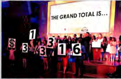
Students reveal the grand fundraising total.

DAP congratulates this year's big high school fundraising champ Gus Robertson.