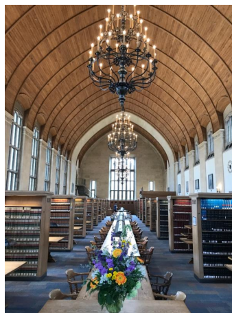
Reading Room of the Cornell Law Library