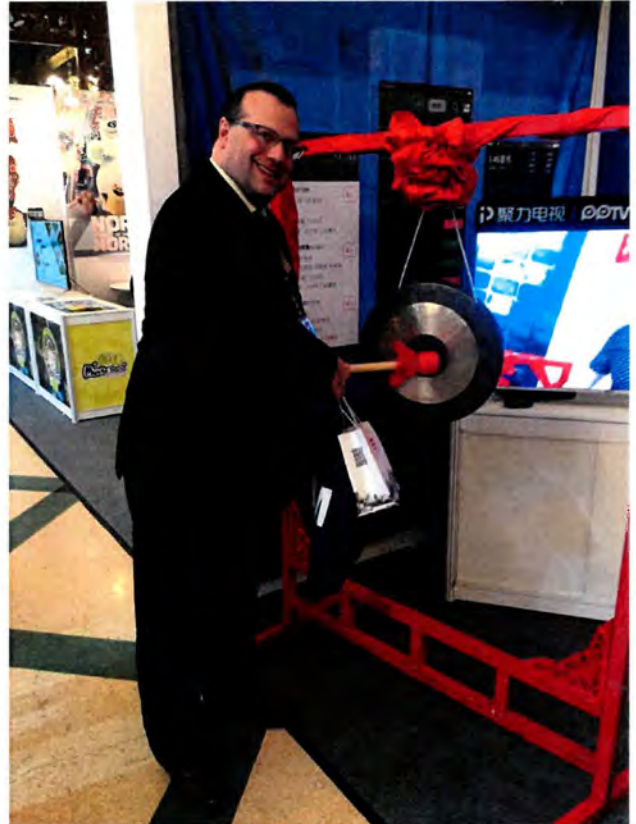
Banging the gong at the Film Market.

In mid-June, DAP attended the Shanghai International Film Festival & Market.