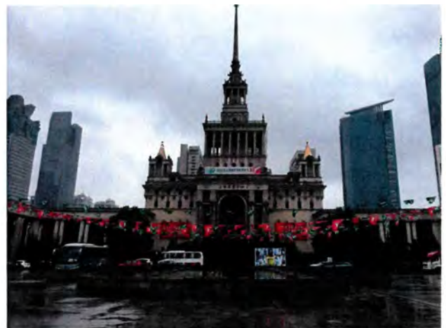
The beautiful ornate convention center where the Shanghai Film Market was held.

DAP then travelled via bullet train to Beijing