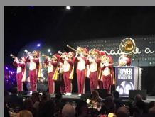
USC Marching Band sounded the trumpets