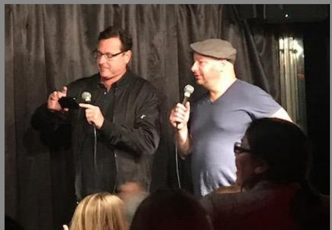
Bob Saget & Jeff Ross riff in support of ZipZapZop

Zip Zap Zop is committed to improving communication skills and thus providing greater access for students with special needs in an inclusive classroom. Pierce Law Group LLP proudly volunteers its time as outside general counsel on a pro bono basis to this charity.